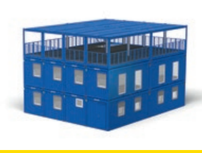
Backup office space with terrace